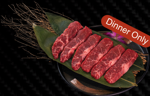
OUTSIDE SKIRT (MARINATED)