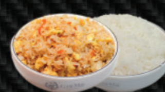
FRIED RICE / WHITE RICE