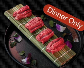
THIN CUT BEEF TONGUE