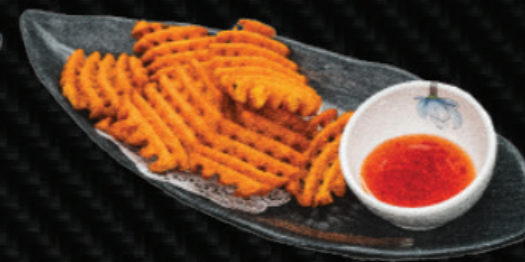
SWEET POTATO FRIES