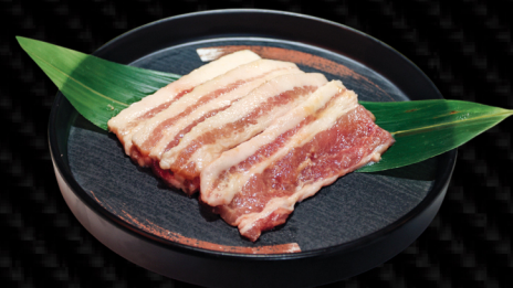
PORK BELLY (MARINATED) MISO OR SPICY