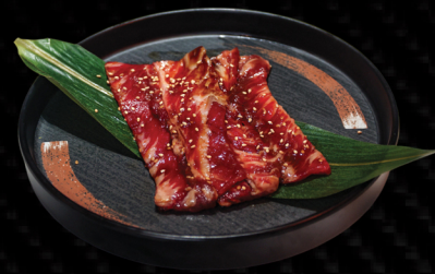
RIB FINGER (MARINATED) HOUSE OR SPICY