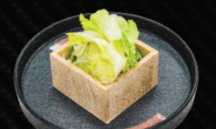
GREEN LEAF LETTUCE