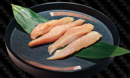
CHICKEN BREAST (MARINATED)