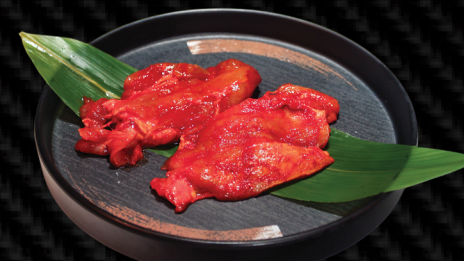
CHICKEN THIGH (MARINATED)