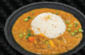
CURRY BEEF OVER RICE