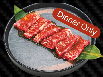
BONELESS SHORT RIBS (MARINATED)