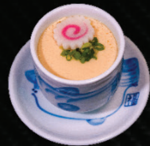
JAPANESE STEAMED EGG