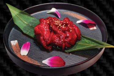
CHUCK ROLL (MARINATED) HOUSE OR SPICY