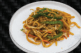
STIR FRY UDON