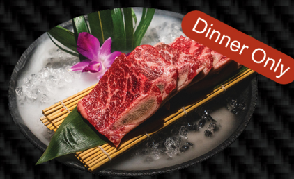
BONE IN SHORT RIBS (MARINATED)