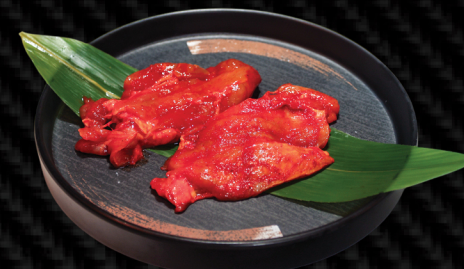
CHICKEN THIGH (MARINATED)