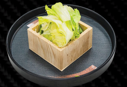
GREEN LEAF LETTUCE