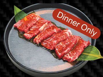
BONELESS SHORT RIBS (MARINATED)