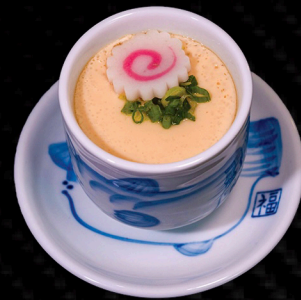
JAPANESE STEAMED EGG