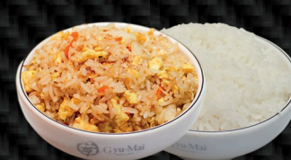
FRIED RICE / WHITE RICE