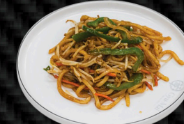
STIR FRY UDON