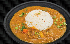
CURRY BEEF OVER RICE