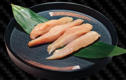
CHICKEN BREAST (MARINATED)