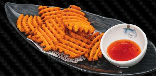
SWEET POTATO FRIES